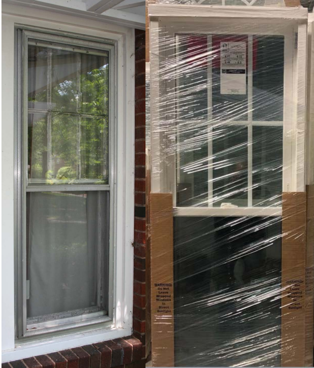
The windows will have the same configuration and size, fitted to each window.