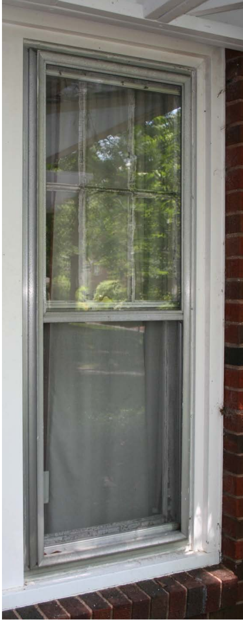
Old Storm Windows