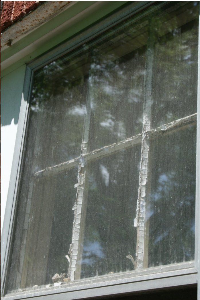
Glazing Falling Off